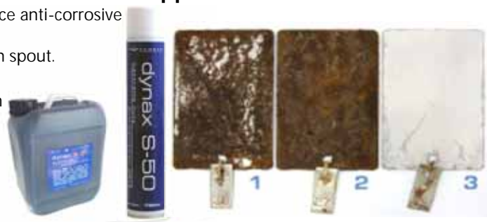
SAMPLE 3 - Is Dynax S-50 tested against other products