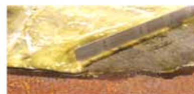
After 12 hours scrap off